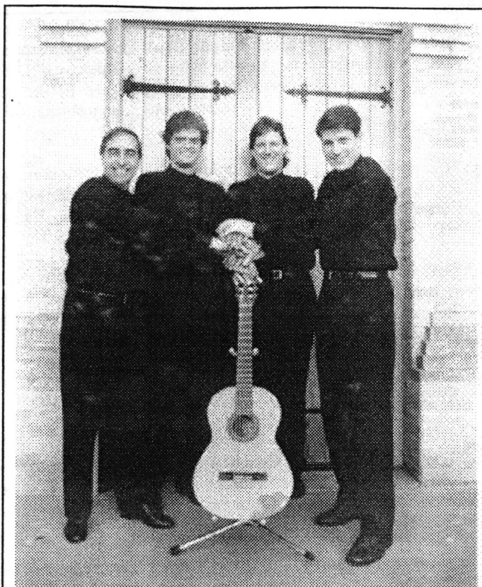
SANTA FE GUITAR QUARTET